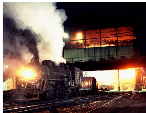
Photo courtesy of en.wikipedia.org/wiki/Northwestern_Steel_and_Wire (1964)

The site of the old Northwestern Steel & Wire Plant, which is relatively flat and measures 730 acres, is located in the Whiteside County of Illinois. The Union Rail Line runs north of the property. Interstate 88 is two miles away from the site, while U.S. Route 30 is to the south of the site. The Rock River borders the south side of the site. The property itself is 110 miles from the city of Chicago.